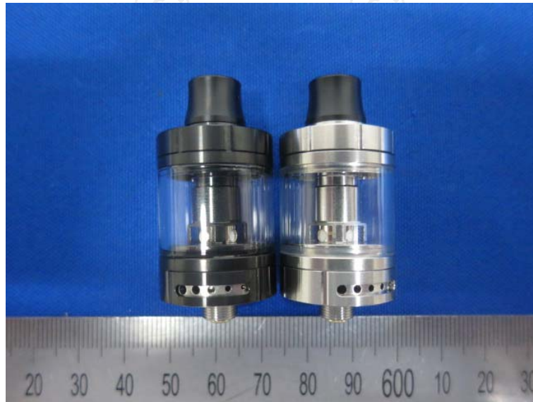
Vapefly Nicolas MTL flavor tank 0.6 Coil