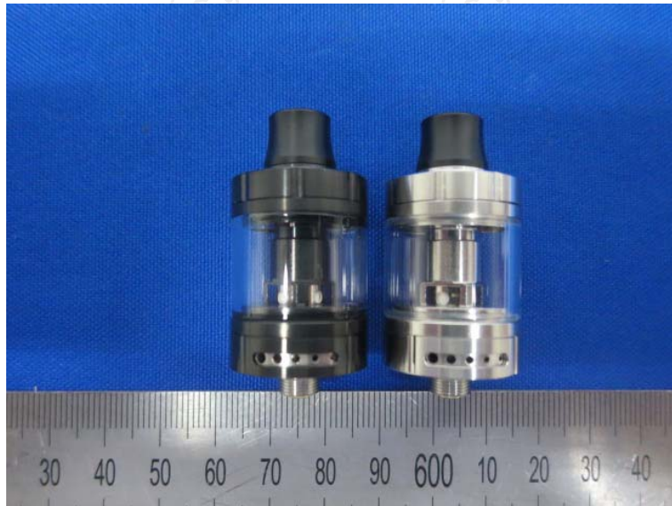
Vapefly Nicolas MTL flavor tank 1.8 Coil