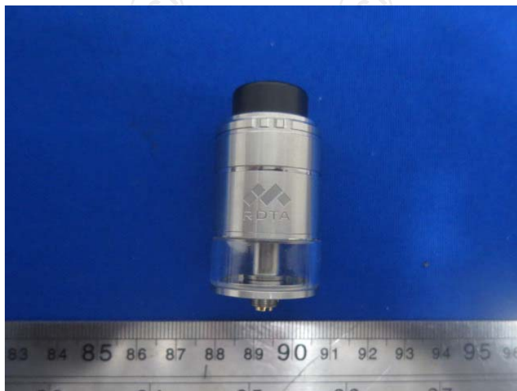
Vapefly Mesh Plus RDTA