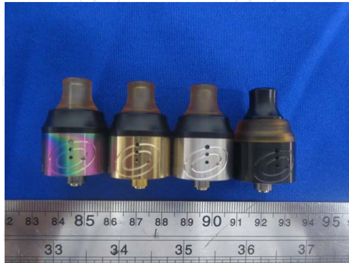
Vapefly Galaxies MTL RDA